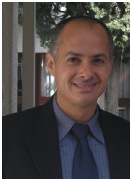
Omar Yaghi, discoverer of MOFs, is a chemist with Berkeley Lab and UC Berkeley and co-director of the Kavli Energy Nanoscience Institute.

molecules by MOFs occurs stochastically.”