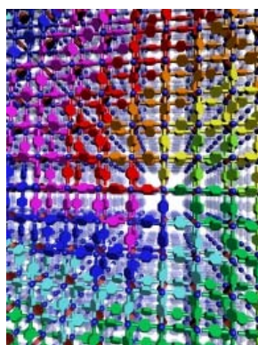
Image of 3-D, synthetic DNA-like crystals created by Yaghi, Deng and colleagues

UCLA chemists report creating a synthetic "gene" that could capture heat-trapping carbon dioxide emissions, which contribute to global warming, rising sea levels and the increased acidity of oceans.